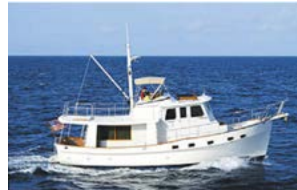
42' Kadey Krogen Trawler

asked to handle Global Claims' CHUBB Account as their third party administrator, handling claims up to $750,000. Here she