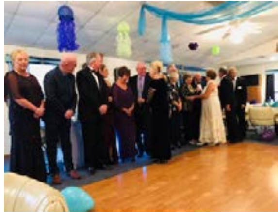
Commodore's Ball Receiving Line