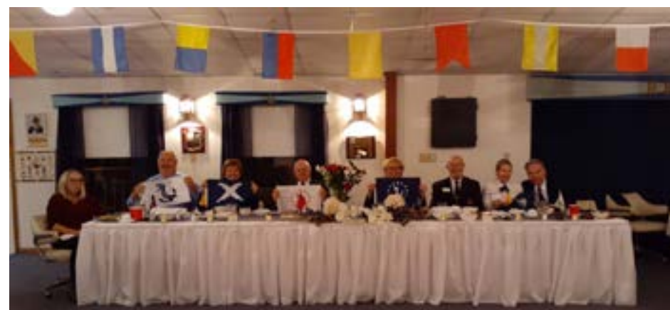
HBYC Bridge members preside over the Change of Watch ceremony