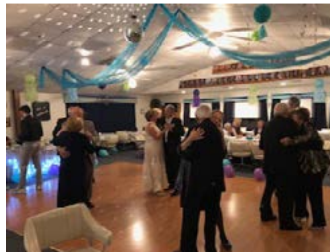
Club dancers on the dance floor