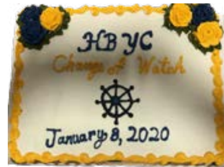
A cake for a Change of Watch