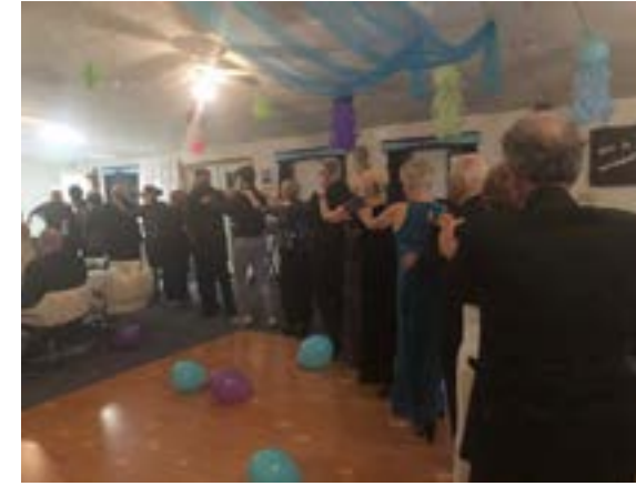
Commodore's Ball Conga Line