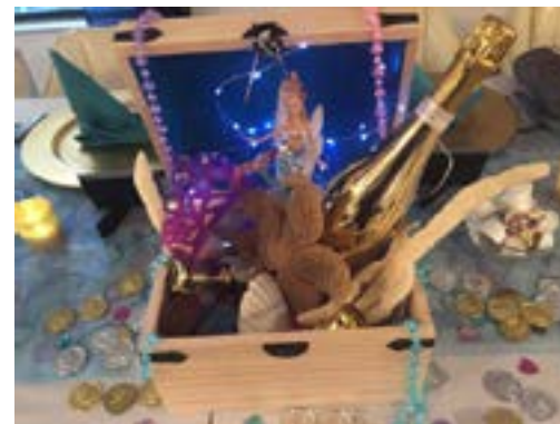
Treasure chest for Commodore Patti Ames filled with gifts from the sea