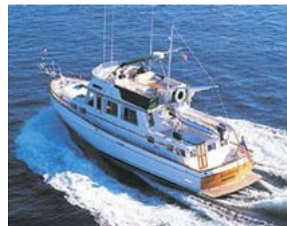
42' Grand Banks Trawler

secured her Accredited Claims Adjuster (ACA) license.