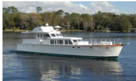
65' Huckins Motor Yacht