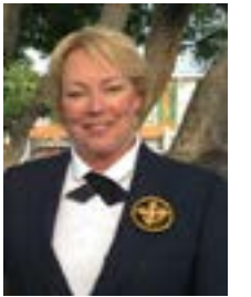
Commodore Patti Ames