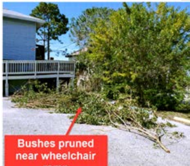
Bushes pruned near wheelchair ramp